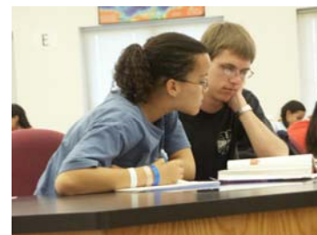
Student and Tutor working hard